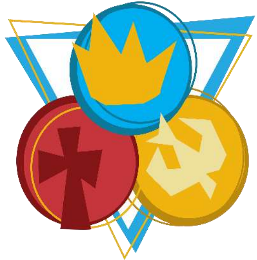
Image: Glory be to the Father and to the Son and to the Holy Spirit; as it was in the beginning, is now, and will be forever. Amen.

On this Holy Trinity Sunday, we do not so much explain God as confess Him. We testify to Him who has revealed Himself to us. To the mind in search of reasonable answers, God will always be a question or riddle to be solved. But to the empty heart, the Holy Spirit leads us to see with faith the God whose majesty has worked for our salvation and whose mercy has rescued us sinners from sin and the grave. Like Nicodemus of old, we want to know how, yet our Lord gives us not the how, but the who; not the explanation, but the mystery of mercy big enough to save us. We come today confessing with our fathers in faith the Athanasian Creed, singing "Holy, Holy, Holy," and rejoicing in the God who is bigger than we are, but who becomes one of us to save us.