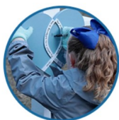
Hearts of Mercy & Compassion